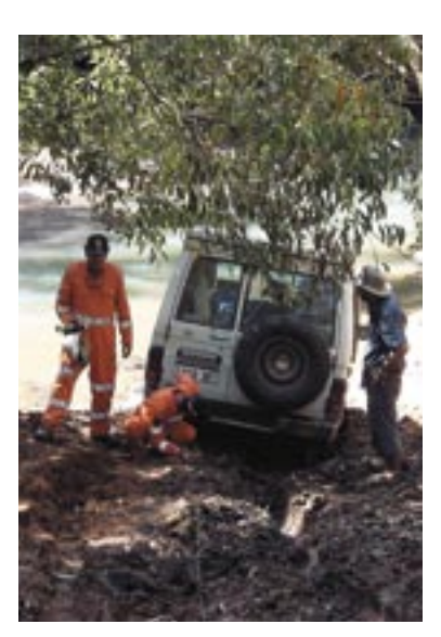
SES crews help out in all kinds of situations.

In the end, the team was rewarded with $20 and the view of the vehicle heading even further north. No lessons learnt here for some.