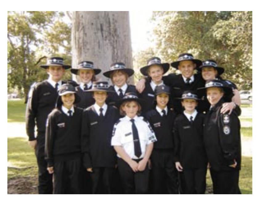
Ready for inspection at Government House Victoria parade.