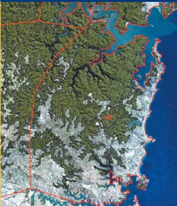
Image 1. Aerial view of Sydney's bushland urban interface showing the complexity of the urban vegetation mix. (Chen and McAnaney, 2005 in Lowe, 2008).

As a result of internal investigation it was evident that NSW Fire Brigades could further improve its operational and risk management procedures in I-Zone emergencies. It was identified that the development of a robust method of supporting critical decision making by command officers, in the form of I-Zone Planning, was critical to successfully mitigating the effects of these emergencies. This decision support tool has the safety of firefighters, operating in these volatile high risk environments, as its key objective. I-Zone planning enhances the NSW Fire Brigades performance to mitigate the effects of I-Zone emergencies, and support the Rural Fire Service (RFS), the lead combat agency for bushfire in New South Wales.