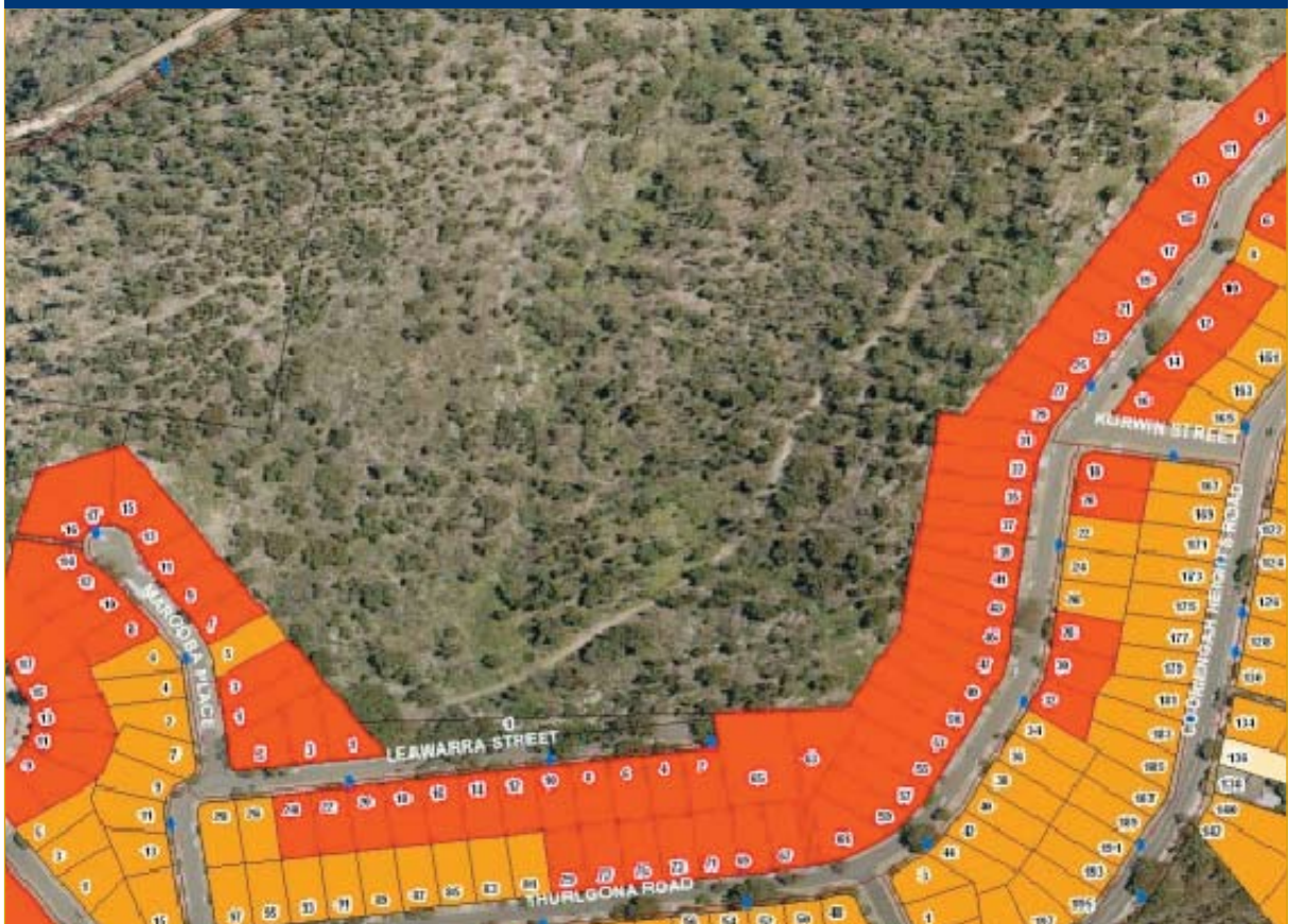
Image 3. FireAus Risk Rating Thurlgona Rd. Engadine, southern Sydney. NSWFB Bushland Urban Interface Section.

The defendable space is defined as "a home's characteristics, its exterior material and design, in relation to the immediate area around a home within 30 metres, principally determine the home ignition