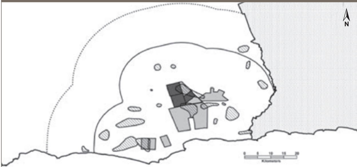
FIGURE 3. Because of the large area of the CA, surveillance efforts are restricted to the Ravensthorpe Shire to the west. The eastern edge of the CA is delineated by the Ravensthorpe-Esperance Shire boundary. Stippled area east of Shire boundary (Esperance Shire) was excluded from the final PZ and SZ. High priority target areas, identified by aerial surveys, are indicated in diagonal fill. Other features are described in the caption for Figure 2.

An emergency incident centre was established which was equivalent to a Local Disease Control Centre (LDCC; Animal Health Australia 2004). Key roles at the LDCC included an LDCC controller, a logistics manager, a mapping officer, a land holder liaison officer, a public relations officer and team leaders for the field surveillance teams. Many of the roles and responsibilities outlined in the Animal Health Australia (2004) manual were incorporated into the roles outlined above, with some participants taking