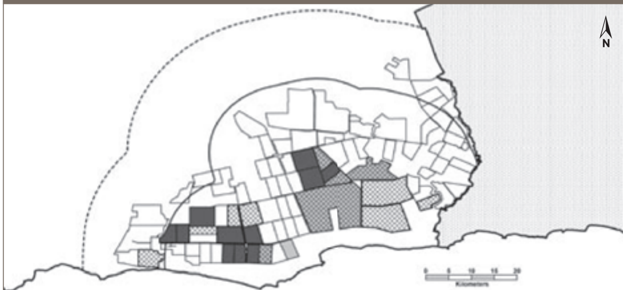
FIGURE 5. Results of ongoing surveillance in the CA until December 2006. Cross hatching represents properties where starlings have been detected following the initial emergency response, along with all properties surveyed without infestations (no shade). Other features are described in the captions for Figures 2, 3 and 4.

Additional challenges with starling control and eradication continue. Following the defining of the extent of the infestation, we could easily use the principles of emergency response to suggest that we