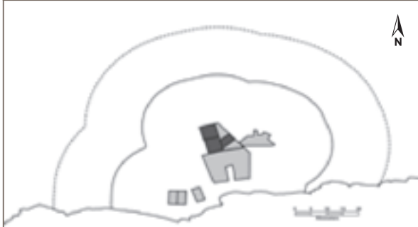
FIGURE 2. Location of the three infected premises (IPs – dark shade) and six suspected infected premises (SIPs – light shade). The control area (CA) is compartmentalised by an inner buffer of 15 km (Protection Zone or PZ – solid line) and an outer buffer of 30 km (Surveillance Zone or SZ – dashed line), with the buffers set about the IPs and SIPs.

area in which to detect low density, cryptic birds. Consequently, the CA was delineated to the east by the local government boundary (Figure 3) and surveillance efforts were concentrated in the western three quarters of the CA. This focus on the western region of the CA was chosen as the most critical front for starlings in Western Australia (i.e. western most boundary), rather than for any definitive biological reason.