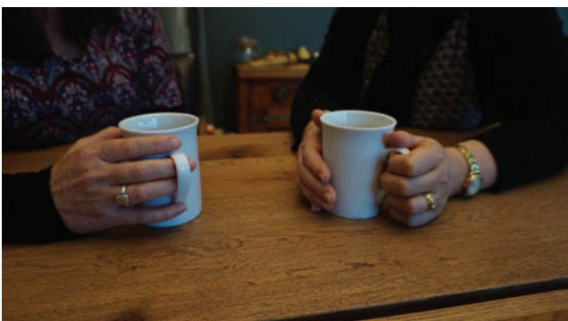
Friendships have developed among those who lost loved ones in the earthquake and many continue to meet to support each other.

Support group members indicated that an organised break would help them escape the tangled processes that follow death after a disaster. They sought sanctuary