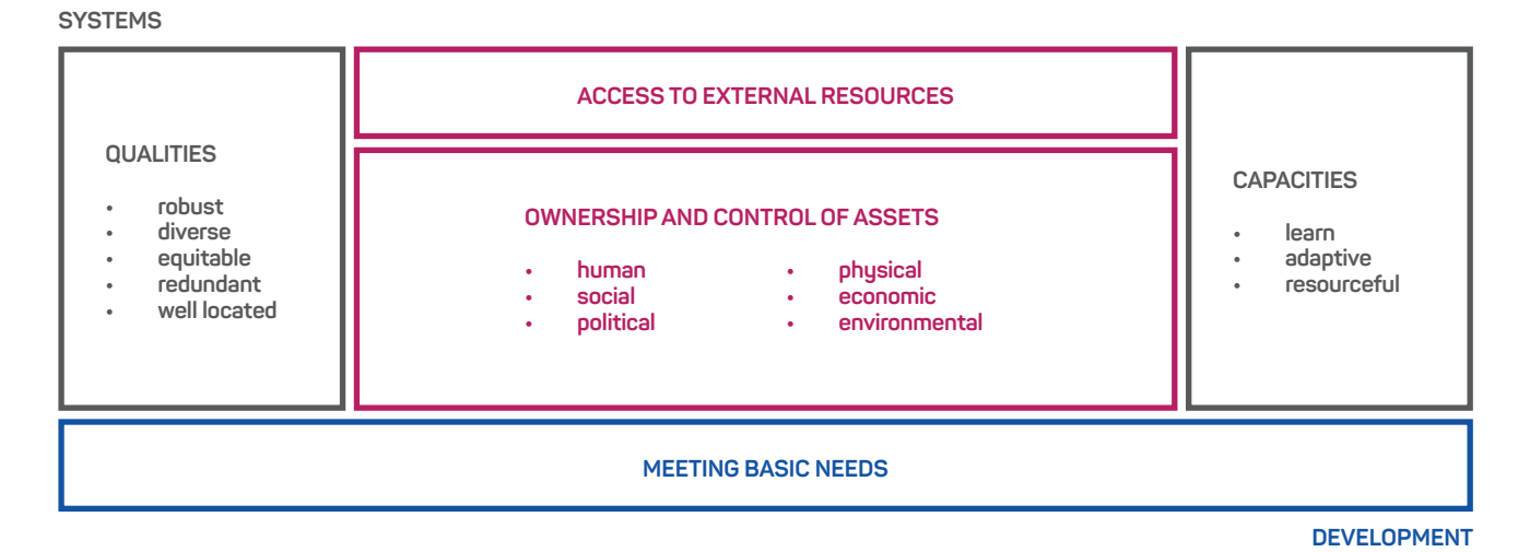
Figure 2: Conceptual framework for community resilience.

(IFRC 2012, copyright permission granted)