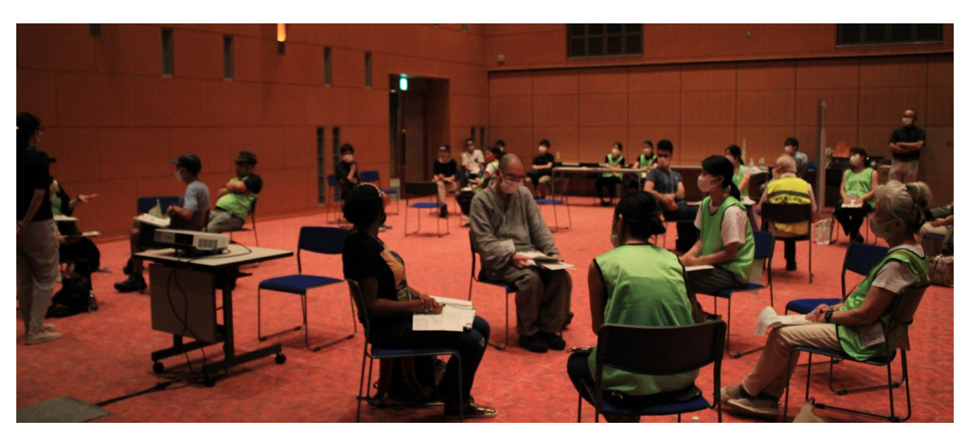
Disaster prevention event for foreign residents conducted at Kokoka Kyoto International Community House, Kyoto City in 2021.