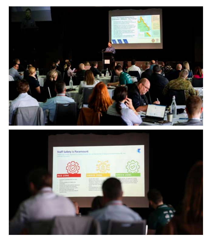
Exercise Averruncus at Kedron-Wavell Services Club on 15 June 2022

As expected, given the wind field, there is very limited damage sustained in Noosa and only a small fraction of buildings in the Sunshine Coast sustain moderate damage. Southwards, and closer to the track of the cyclone, the effects increase through Moreton Bay, Brisbane and Redland. The Gold Coast sustains extensive damage in this scenario, with nearly 100,000 houses extensively damaged and another near 37,000 sustaining moderate levels of damage. Only a small number of regions in the Gold Coast are rated as 'complete damage' (Figure 5) but these are in the hinterland where local wind speeds are high due to the steep topography. Table 1 summarises the residential building damage for the region.