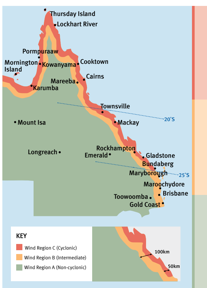
Wind Region C (Cyclonic)

incorporating thunderstorm wind gusts into the severe wind hazard assessment, with review from insurance industry experts