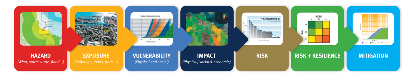
Figure 3: Method used for the SWHA-SEQ project.

1. Australian Disaster Resilience Index, at https://adri.bnhcrc.com.au/#!/.