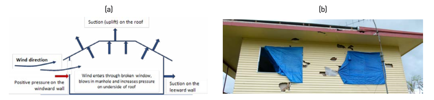
Figure 2: (a) Wind pressures on building and (b) example of damage caused by debris during a Tropical Cyclone Seroja.

Figure 1: Wind loading regions for residential design standards (AS/NZS 1170.2 2011).