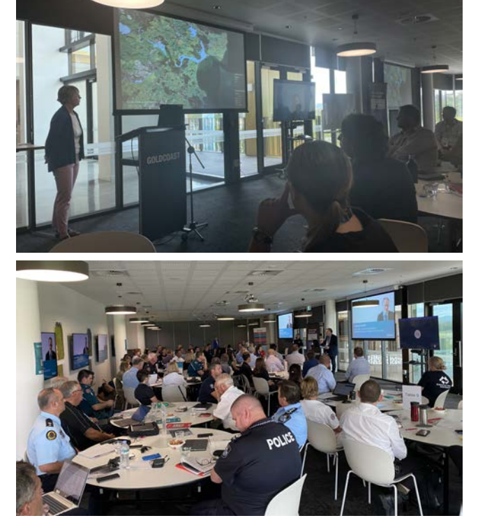
Exercise Enigma, City of Gold Coast Local Disaster Management Group, 24 January 2023.