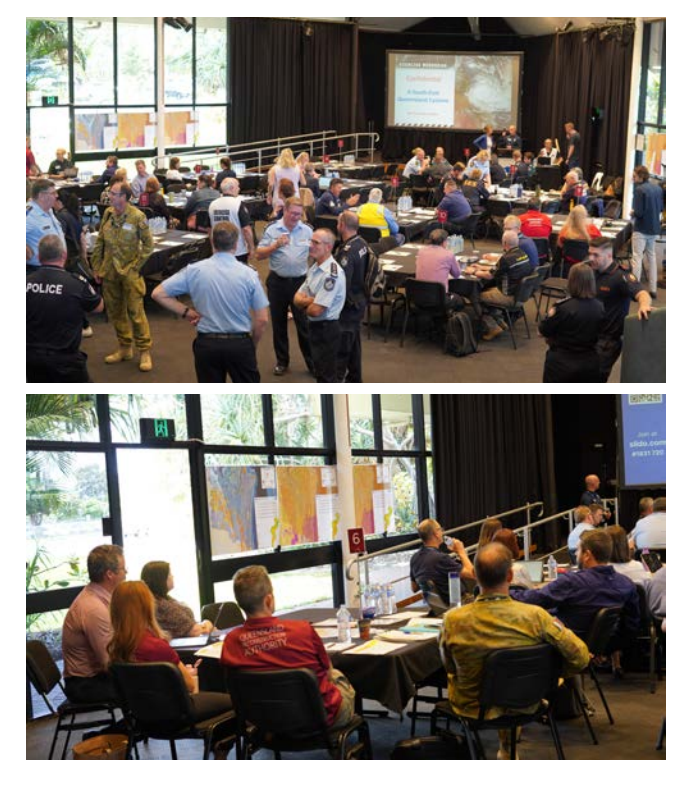
Exercise Miberran, Redland City Local Disaster Management Group, 8 November 2022.

In the case of the City of Gold Coast, a stand-alone project has been initiated—Project AIR (Advocacy, Information and Resilience)—that has been resourced over 5 years to harden places of last resort, embed the engagement strategy and influence better community safety outcomes for the Gold Coast community and visitors. To begin exploring the risk to stratatitle buildings, the City of Gold Coast has been successful in the first round of the Commonwealth Disaster Ready Fund with a $400,000 strata study. Project AIR influenced the construction of a new community centre to better plan for the future.