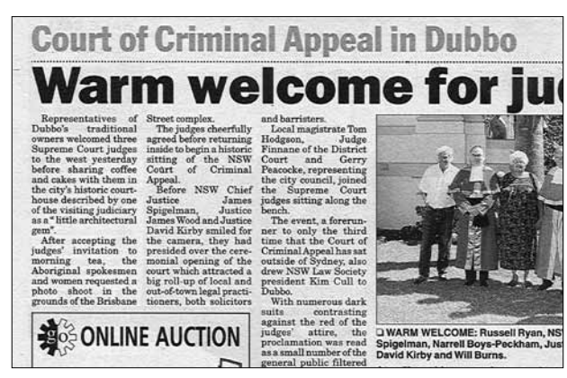
Weekend Liberal, Saturday, 9 February 2002, p.4.

Wagga Wagga sittings of the Court of Criminal Appeal in 2000, referred to the tradition of the courts bringing justice to the regions that dated to Saxon and Norman times in England.