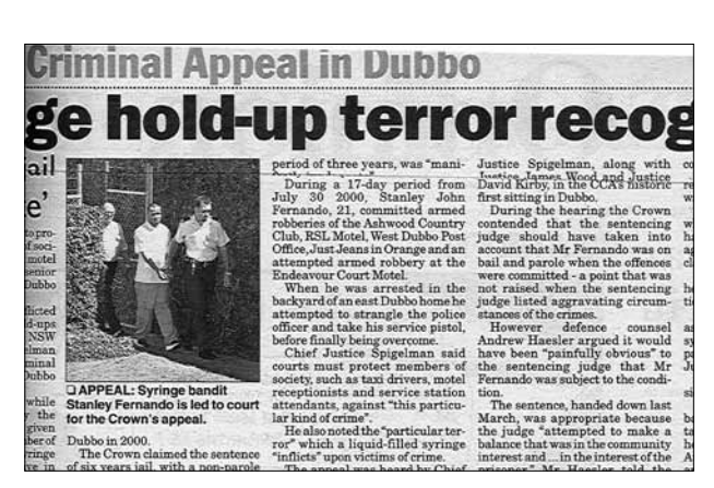
Weekend Liberal, Saturday, 9 February 2002, p.5.

The opposite is true of country towns. Along with the support that residents offer each other, people have a tendency to closely follow local issues. The trait is fostered by what is an almost uniformly strong regional press. Even smaller country towns like Cowra (The Cowra Guardian), Molong (The Molong Express) and Grenfell (The Grenfell Record) have their own newspaper.